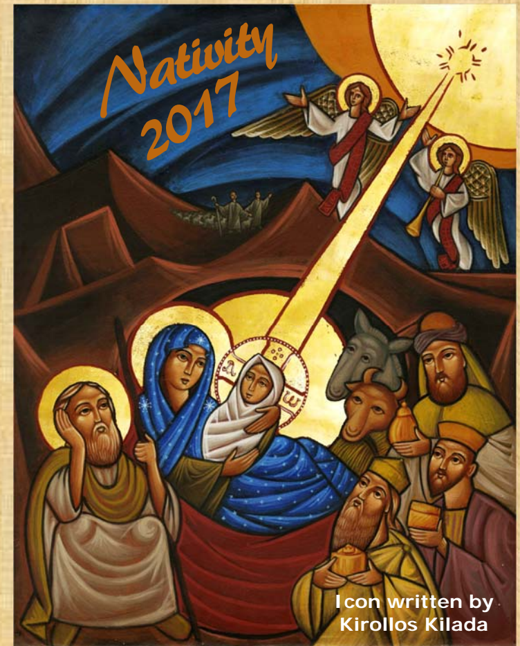
Icon written by Kirolos Kilada